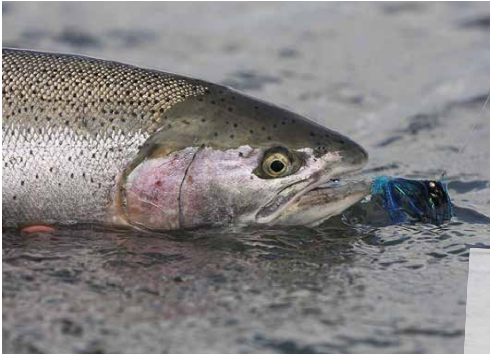
Left, Remote and chock-full of steelhead, the Sandy River is a Steelheader's 'Dream Stream'.